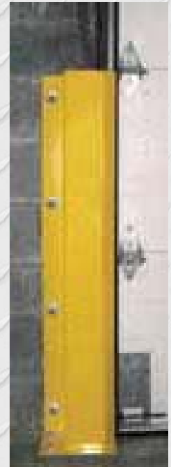
DOOR TRACK PROTECTORS

PROTECT YOUR PEOPLE, PRODUCT AND PHYSICAL PLANT FROM COLLISIONS WITH FORKLIFT TRUCKS AND OTHER ACTIVITIES WITH ONE OF THE BEST INVESTMENTS YOU CAN MAKE. DURA-GUARD IS A PRE-FABRICATED MODULAR PROTECTIVE RAILING SYSTEM THAT CAN BE EXPANDED AND RELOACTED WITH EASE. THIS COST EFFECTIVE SAFETY SOLUTION WILL REDUCE THE COST AND RISKS OF INJURY, LOST PRODUCTION TIME AND DAMAGE TO BUILDING, INVENTORY AND EQUIPMENT.