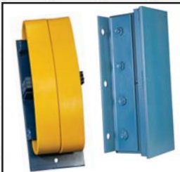
IMPACT™ SERIES DOCK BUMPERS