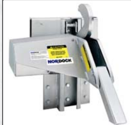
SMART-HOOK® & TRUCK-LOCK® VEHICLE RESTRAINTS

*Add capacity required. Example: Model ND-68-50 = 6' wide x 8' long x 50,000 pound capacity. Special sizes also available.