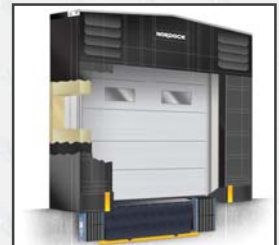
WEARTOUGH® DOCK SEALS & SHELTERS