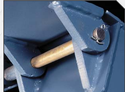
Patented Lip Lug and Header Plate Design