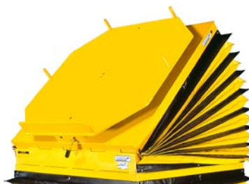
ACCORDION CURTAIN OPTION