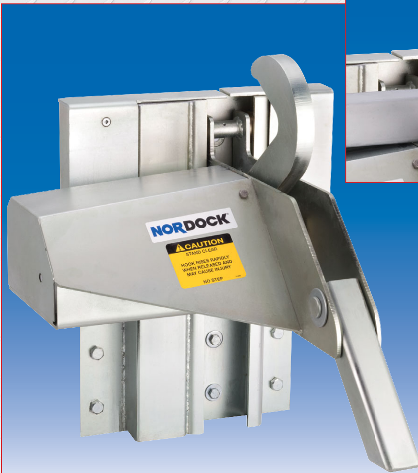
AR-9000 Automatic Restraint