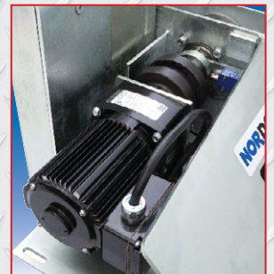
Exclusive Direct Drive System