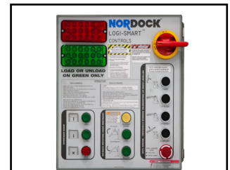
LOGI-SMART® & INTEGRATED CONTROL PANEL