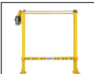
FALL-STOP™ SAFETY BARRIER GATES