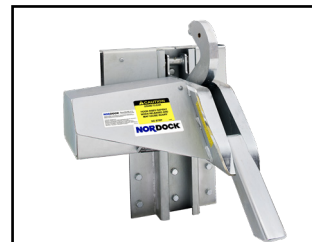
SMART-HOOK® & TRUCK-LOCK® VEHICLE RESTRAINTS