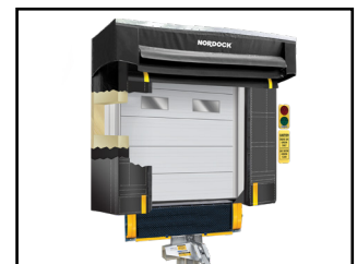
WEARTOUGH® DOCK SEALS & SHELTERS

www.nordockinc.com - sales-nordock@iwsolutions.com - Toll Free: 1-866-885-4276