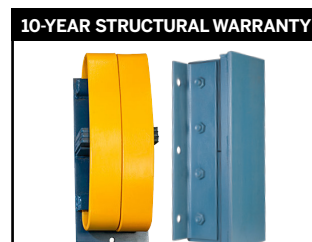
10-YEAR STRUCTURAL WARRANTY IMPACT™ SERIES STEEL SPRING & STEEL FACE DOCK BUMPERS