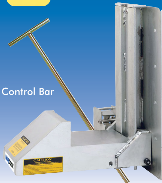
Low Profile Stored Position