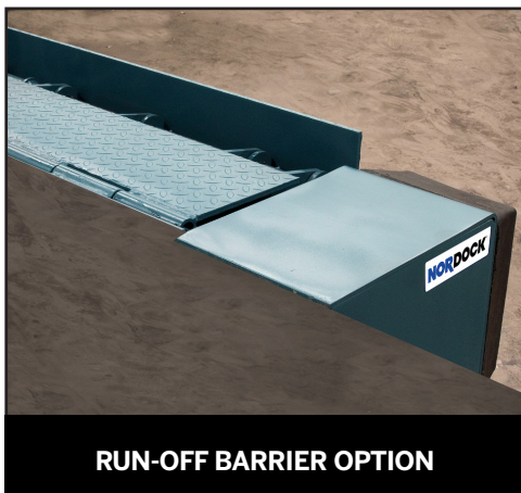
RUN-OFF BARRIER OPTION