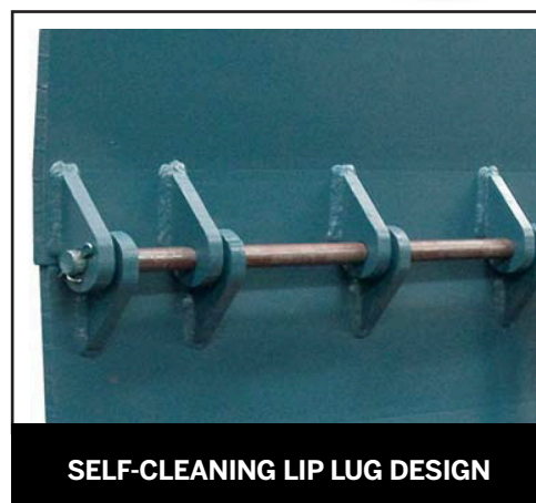
SELF-CLEANING LIP LUG DESIGN

www.nordockinc.com - sales-nordock@iwsolutions.com - Toll Free: 1-866-885-4276