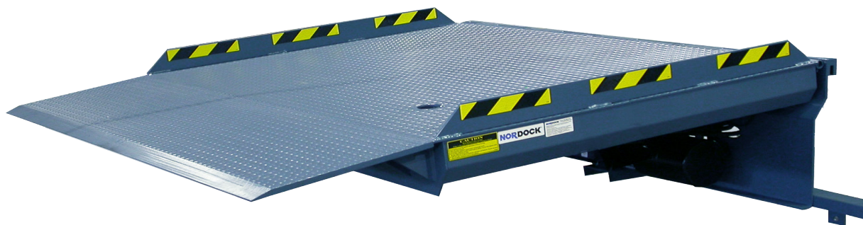
NR Rail Dock Leveler in Loading Position

www.nordockinc.com - sales-nordock@iwsolutions.com - Toll Free: 1-866-885-4276