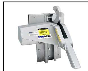
SMART-HOOK® & TRUCK-LOCK® VEHICLE RESTRAINTS