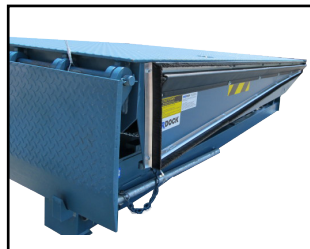
BRUSH & ALL-SEAL™ WEATHER SEAL SYSTEMS