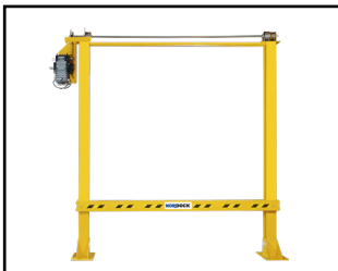
FALL-STOP™ SAFETY BARRIER GATES