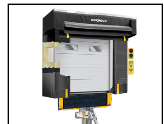
WEARTOUGH® DOCK SEALS & SHELTERS

www.nordockinc.com - sales-nordock@iwsolutions.com - Toll Free: 1-866-885-4276