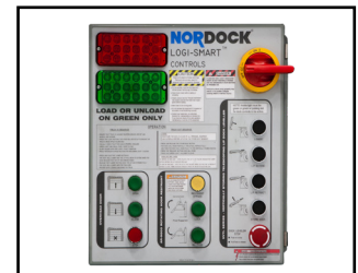
LOGI-SMART® & INTEGRATED CONTROL PANEL