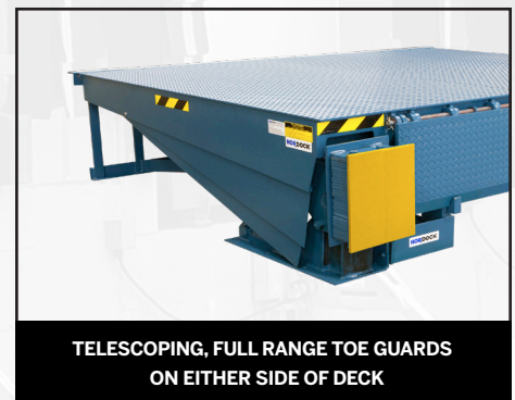
TELESCOPING, FULL RANGE TOE GUARDS ON EITHER SIDE OF DECK