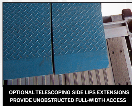
OPTIONAL TELESCOPING SIDE LIPS EXTENSIONS PROVIDE UNOBSTRUCTED FULL-WIDTH ACCESS