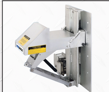
TRUCK-LOCK® VEHICLE RESTRAINTS (AVAILABLE)