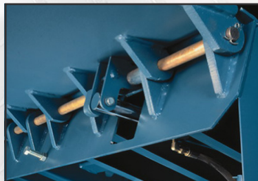
EXCLUSIVE LIP LUG & HEADER PLATE DESIGN WITH 20-YEAR WARRANTY