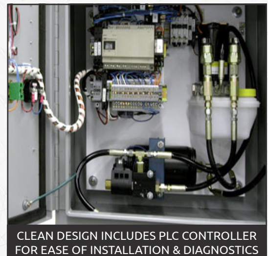
CLEAN DESIGN INCLUDES PLC CONTROLLER FOR EASE OF INSTALLATION & DIAGNOSTICS