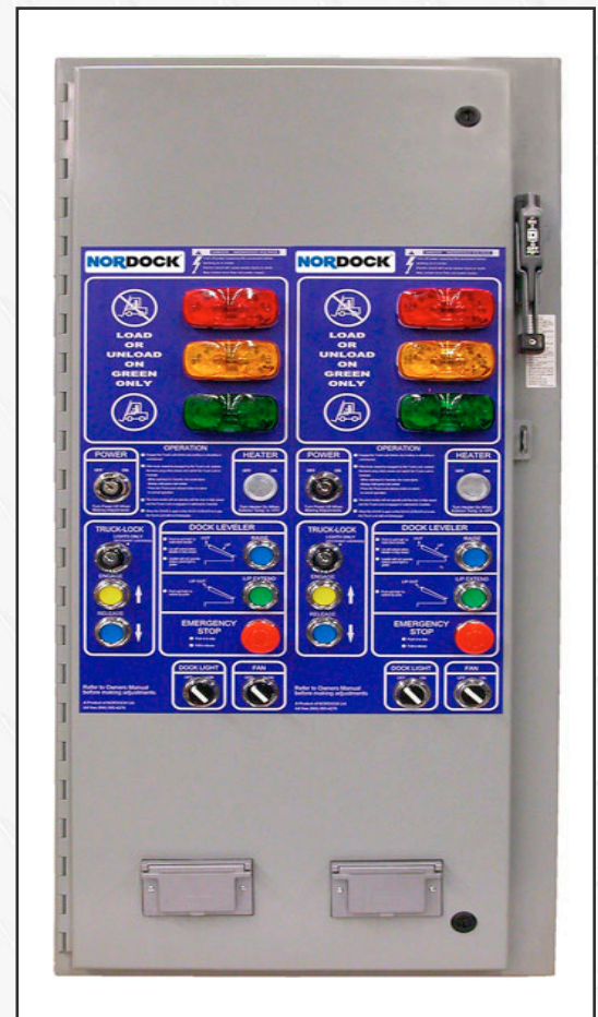
DUAL LOADING DOOR PANEL WITH FLANGED DISCONNECT & 120 VOLT RECEPTACLES