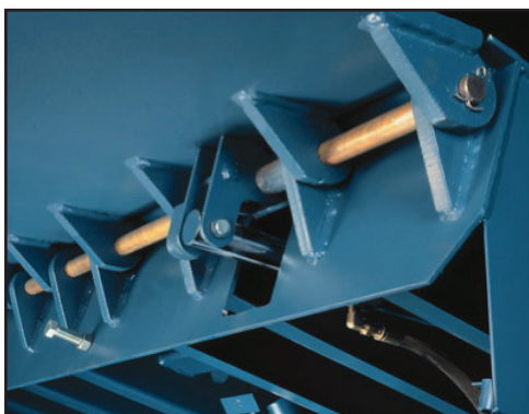
EXCLUSIVE LIP LUG & HEADER PLATE (FRONT HINGE) 20-YEAR WARRANTY