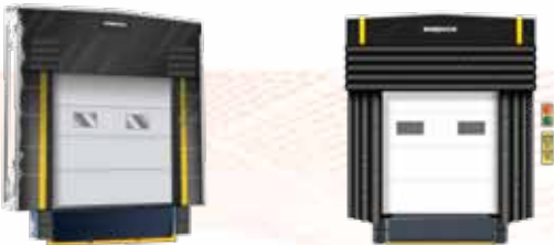
RETRACTAFRAME™ Dock Shelters Inflatable Dock Shelters