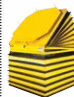
Lift, Tilt & Rotator