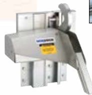
IMPACT™ Rotating Hook