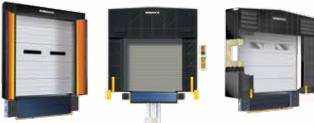
SEAL-TITE™ Dock Seal Rigid Frame Dock Shelters FOAMFRAME™ Shelters