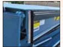
ALL-SEAL™ Dock Leveler Energy Saver