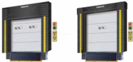
Head Curtain Dock Seal Fixed Header Dock Seal