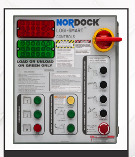
LOGI-SMART® INTEGRATED CONTROL PANEL