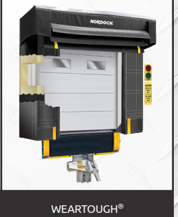
WEARTOUGH® DOCK SEALS & SHELTERS