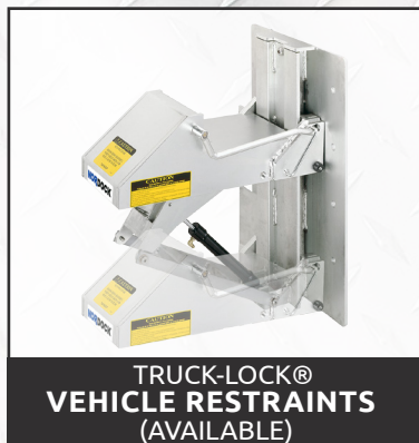
TRUCK-LOCK® VEHICLE RESTRAINTS (AVAILABLE)