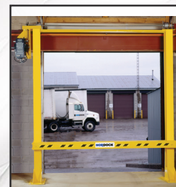
FALL-STOP™ SAFETY BARRIER GATE