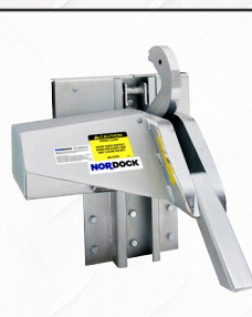
SMART-HOOK® & TRUCK-LOCK® VEHICLE RESTRAINTS