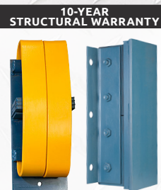
10-YEAR STRUCTURAL WARRANTY