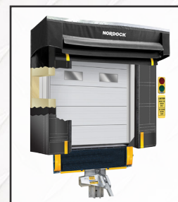
WEARTOUGH® DOCK SEALS & SHELTERS