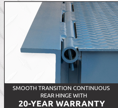
SMOOTH TRANSITION CONTINUOUS REAR HINGE WITH 20-YEAR WARRANTY