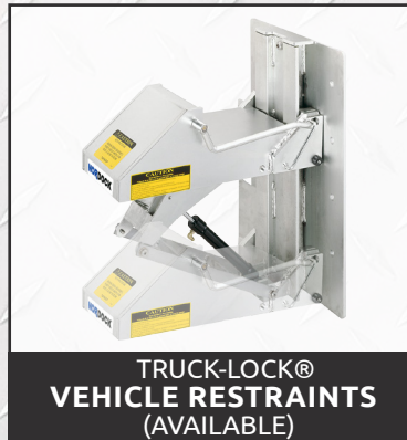
TRUCK-LOCK® VEHICLE RESTRAINTS (AVAILABLE)