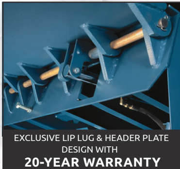
EXCLUSIVE LIP LUG & HEADER PLATE DESIGN WITH 20-YEAR WARRANTY