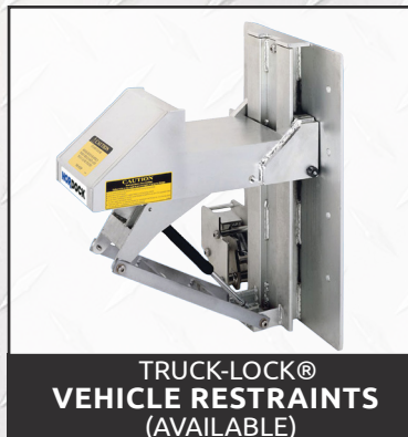
TRUCK-LOCK® VEHICLE RESTRAINTS (AVAILABLE)