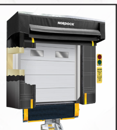
WEARTOUGH® DOCK SEALS & SHELTERS