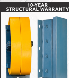
10-YEAR STRUCTURAL WARRANTY