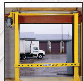
FALL-STOP™ SAFETY BARRIER GATE