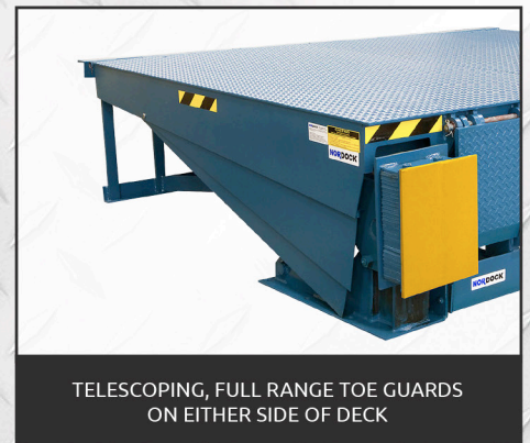
TELESCOPING, FULL RANGE TOE GUARDS ON EITHER SIDE OF DECK