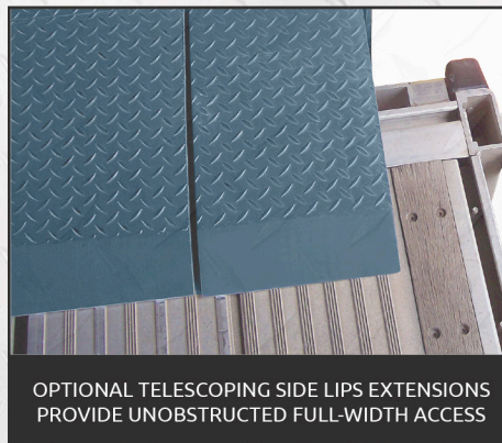
OPTIONAL TELESCOPING SIDE LIPS EXTENSIONS PROVIDE UNOBSTRUCTED FULL-WIDTH ACCESS