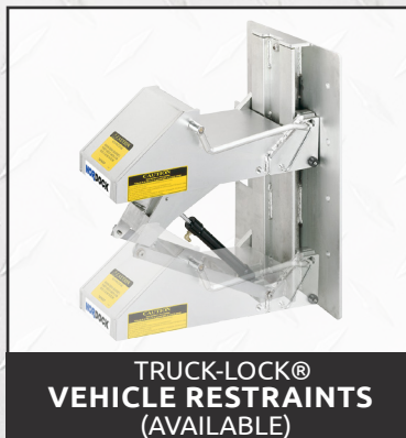
TRUCK-LOCK® VEHICLE RESTRAINTS (AVAILABLE)