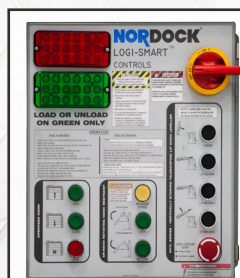
LOGI-SMART® INTEGRATED CONTROL PANEL