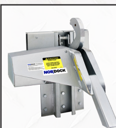
SMART-HOOK® & TRUCK-LOCK® VEHICLE RESTRAINTS