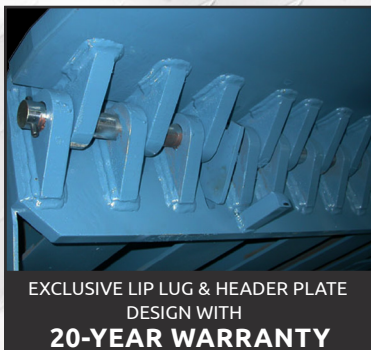
EXCLUSIVE LIP LUG & HEADER PLATE DESIGN WITH 20-YEAR WARRANTY