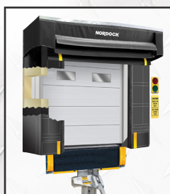
WEARTOUGH® DOCK SEALS & SHELTERS