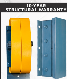
10-YEAR STRUCTURAL WARRANTY