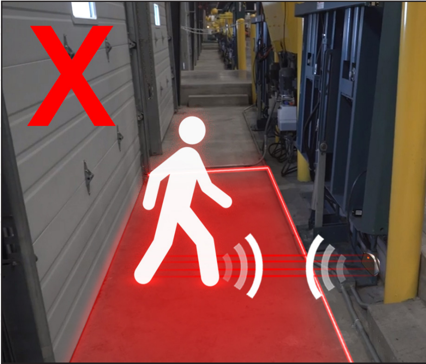
MOVEMENT DETECTED IN THE PIT AREA INDICATES THE VERTICAL LEVELER TO IMMEDIATELY STOP