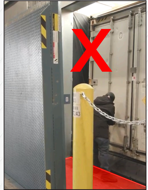
VERTICAL LEVELER WILL NOT LOWER UNTIL PIT AREA IS FREE & CLEAR OF MOVING PEOPLE/OBSTRUCTIONS