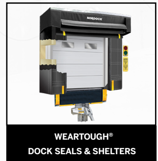
WEARTOUGH® DOCK SEALS & SHELTERS