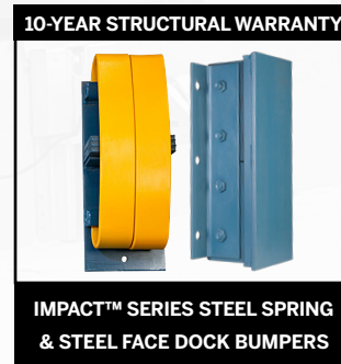
10-YEAR STRUCTURAL WARRANTY