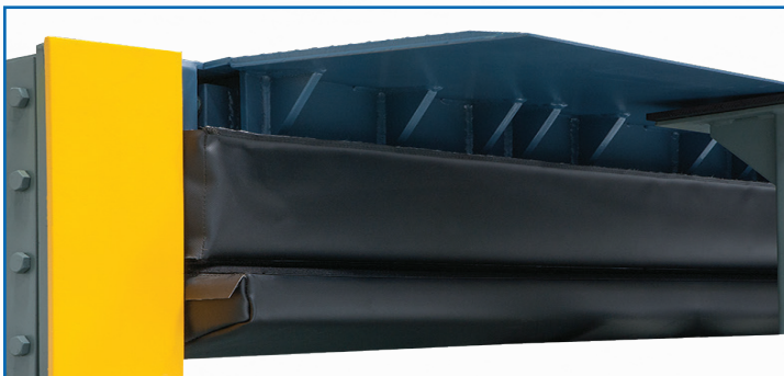
TELESCOPING-LIP™ levelers come standard with the first true 360 degree BUMPER-TO-BUMPER™ 4-Sided Pit Seal

The TLH RETROFIT™ provides infinite end load access with precise lip extension control, safely bridging the gap between deck & trailer bed for forklift access. Completely avoids all damage to cargo &/or forklift. Hand unloading is eliminated forever – resulting in labor savings & a safer working environment.