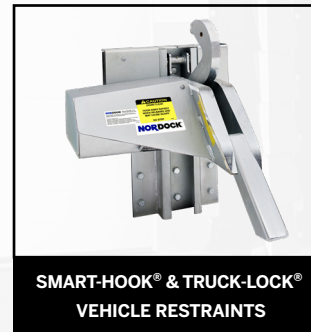
SMART-HOOK® & TRUCK-LOCK® VEHICLE RESTRAINTS

Consult your NORDOCK® representative for assistance in choosing the correct capacity and options for your application.