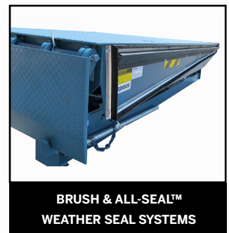
BRUSH & ALL-SEAL™ WEATHER SEAL SYSTEMS