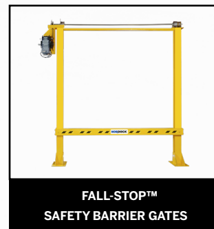
FALL-STOP™ SAFETY BARRIER GATES