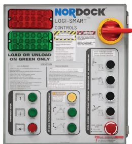
LOGI-SMART™ DUST TIGHT CONTROL PANEL