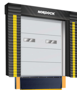
WEARTOUGH® DOCK SEALS AND SHELTERS