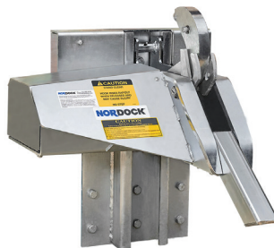
SMART-HOOK® SAFETY SYSTEMS