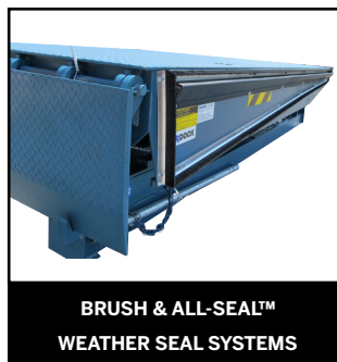
BRUSH & ALL-SEAL™ WEATHER SEAL SYSTEMS