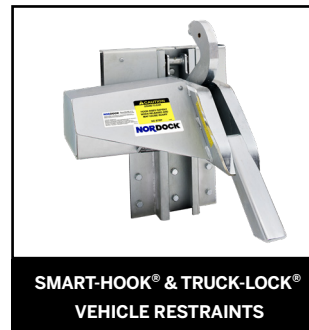
SMART-HOOK® & TRUCK-LOCK® VEHICLE RESTRAINTS