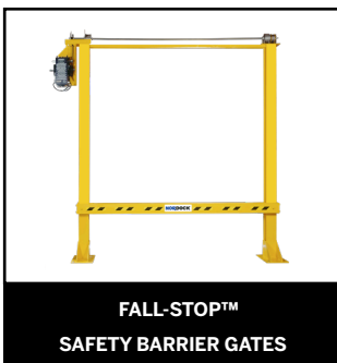
FALL-STOP™ SAFETY BARRIER GATES