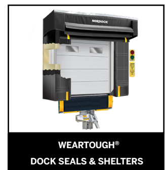
WEARTOUGH® DOCK SEALS & SHELTERS

www.nordockinc.com - sales-nordock@iwsolutions.com - Toll Free: 1-866-885-4276