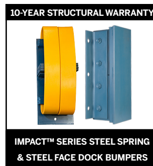
10-YEAR STRUCTURAL WARRANTY IMPACT™ SERIES STEEL SPRING & STEEL FACE DOCK BUMPERS