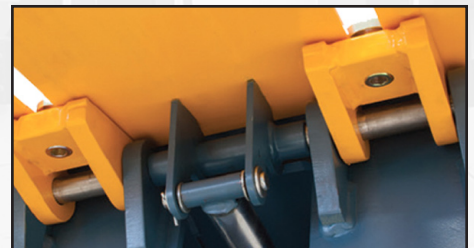
DURABLE SELF-CLEANING LUG HINGES PROVIDE MAXIMUM LOAD BEARING SUPPORT