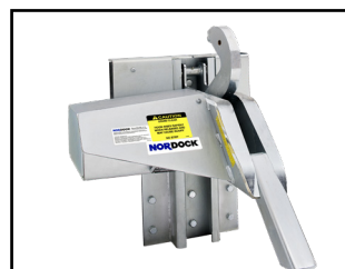
SMART-HOOK® & TRUCK-LOCK® VEHICLE RESTRAINTS