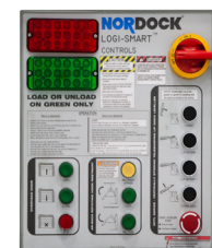
LOGI-SMART® & INTEGRATED CONTROL PANEL