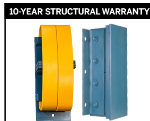
10-YEAR STRUCTURAL WARRANTY IMPACT™ SERIES STEEL SPRING & STEEL FACE DOCK BUMPER