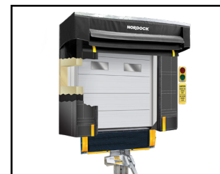
WEARTOUGH® DOCK SEALS & SHELTERS