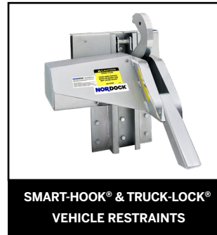
SMART-HOOK® & TRUCK-LOCK® VEHICLE RESTRAINTS

Parts include: Lip hinge, and shaft; deck plate & beams; rear frame & rear hinges.