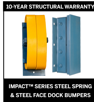
10-YEAR STRUCTURAL WARRANTY IMPACT™ SERIES STEEL SPRING & STEEL FACE DOCK BUMPERS